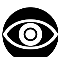
Puffiness around the eyes