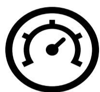
Increased blood pressure

When your kidneys aren't functioning properly, they don't filter out sodium, potentially leading to a number of additional health issues including: