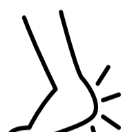
Swollen ankles (edema)