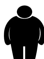
Weight gain from "water" weight